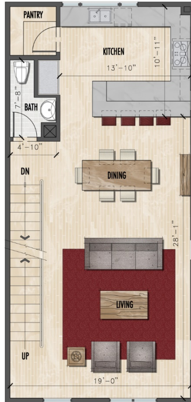
Second Level Plan